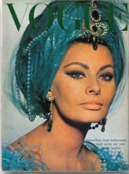
Vogue July 1965