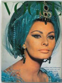
Vogue July 1965