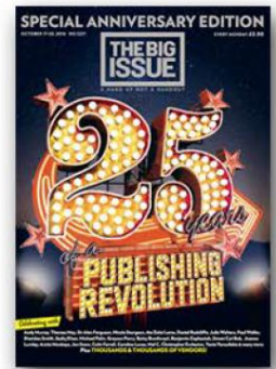
The Big Issue Oct 17-23 2016

How to use: Use this Knowledge Organiser to compare and contrast these magazines. Highlight the similarities and differences.